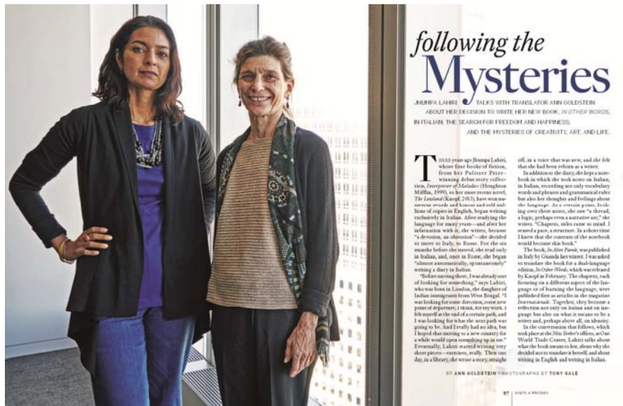
Our continued coverage of the art of translation included a conversation between author Jhumpa Lahiri and translator Ann Goldstein, in the March/April 2016 issue.