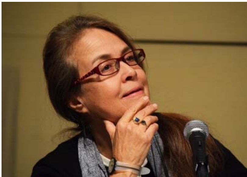
Naomi Shihab Nye leads a conversation with fellow poets and authors at the Why We Write panel at Poets & Writers Live: Inspiration in Austin, Texas.